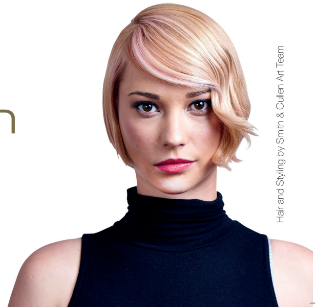
Hair and Styling by Smith & Cullen Art Team